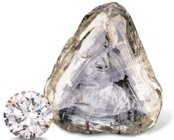
Rough and polished diamonds

Requirements subject to change; students will be given advanced notice of changes.