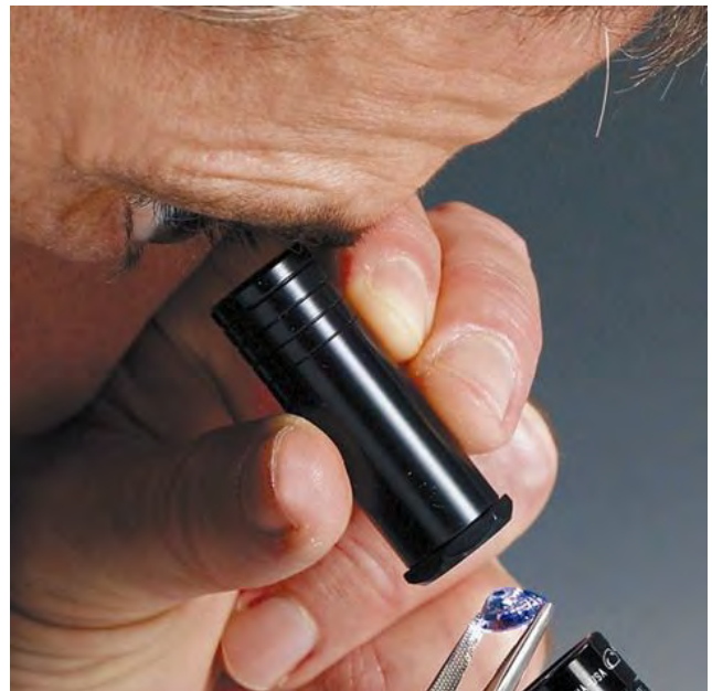
Gem Identification Lab students learn the proper use of gemological equipment like a polariscope (top) and dichroscope (bottom) - ©GIA