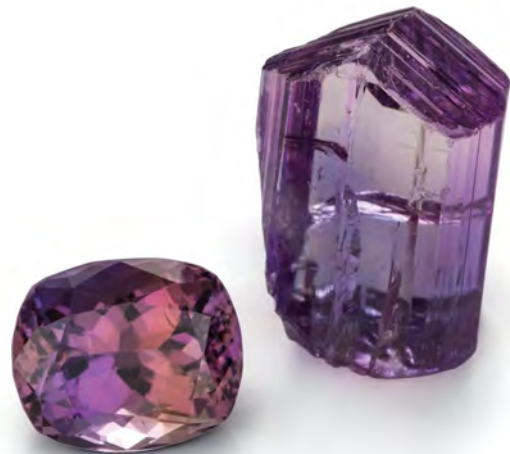
Tanzanite crystal and polished gem.

Requirements subject to change; students will be given advanced notice of changes.