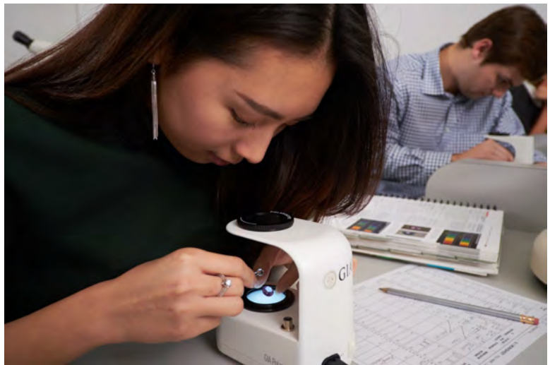
Students use gemological equipment to identify colored stones