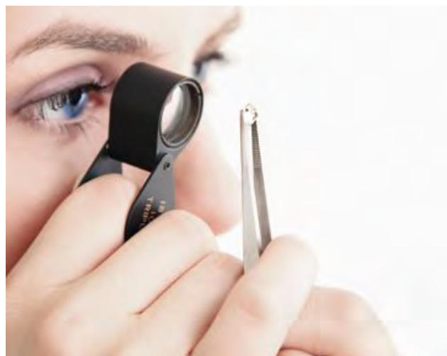
Diamond Grading Lab students assess a diamond's clarity using a 10X jeweler's loupe