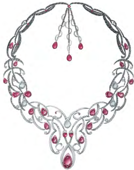
Hand-rendered necklace - ©GIA

Requirements subject to change; students will be given advanced notice of changes.