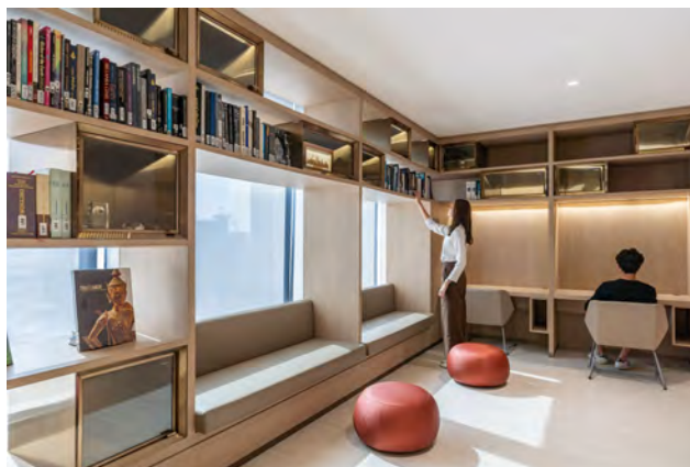
Top: Student Reception; Middle: Student Canteen; Bottom: Library - ©GIA