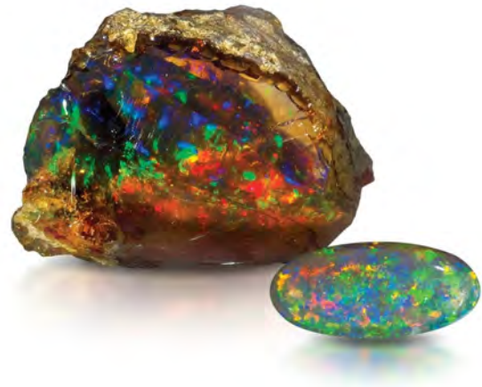
Rough and polished opal.

Requirements subject to change; students will be given advanced notice of changes.