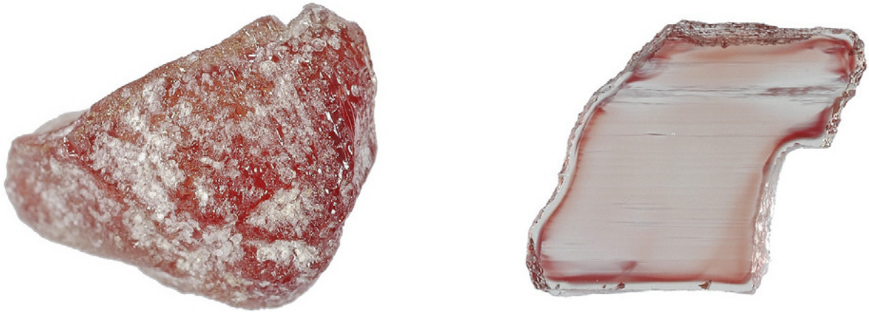
Figure 1. Sample of treated andesine obtained by JGGL from China in 2006. Left: Rough specimen. Right: Wafer polished from the piece at left.