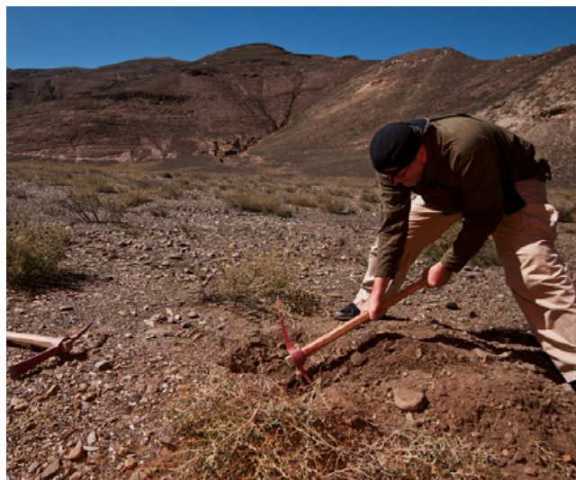
Figure 6. The author excavating beneath a randomly chosen bush just above Zha Lin village in Tibet. Andesines were found well below the surface in two out of three of such randomly chosen spots by the 2010 Abduriyim expedition. In order to salt this mine, one would presumably have had to both know that our party would dig beneath bushes, and thus to carefully place samples across a wide valley under perhaps as many as a thousand bushes.